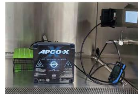
APCO-X™ in test chamber